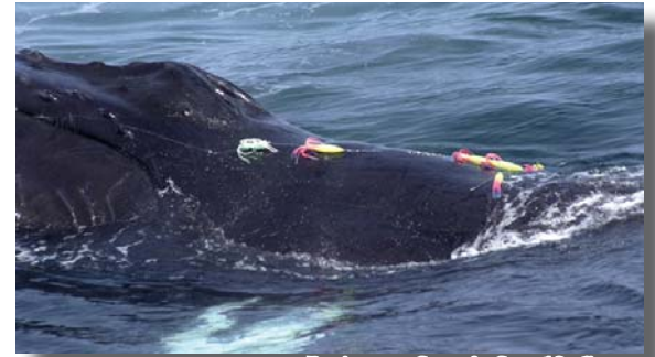
Provincetown Center for Coastal Studies