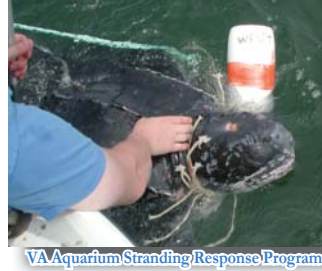
VA Aquarium Stranding Response Program

FOR ALL INTERACTIONS: contact your local stranding network organization (see back panel) or call the U.S.C.G. via VHF Channel 16.