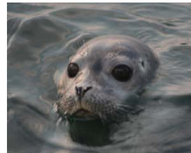
Whale Center of New England/Stellwagen Bank NMS