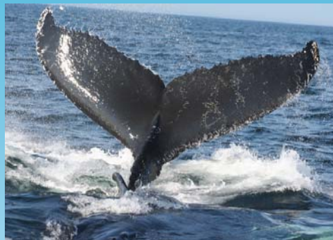
Whale Center of New England/Stellwagen Bank NMS